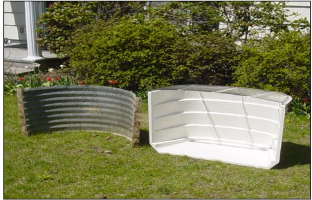
Standard window well (left) and the SunHouse™

The SunHouse™ will never rust, rot or corrode. Enjoy SunHouse™ Basement Window Enclosures installed on all your basement windows!